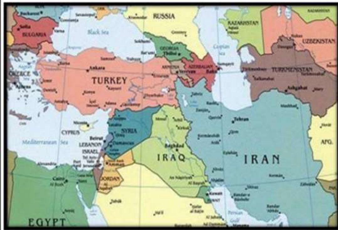
Figure (1): Shows the location of Iraq and neighboring countries.

Spreading democracy in Iraq; Bush claims that the war's objective is to overthrow the Saddam Hussein government, which the US is fighting Iran on behalf of and which initially turned into an opponent. The war, according to their view, was aimed at liberating the Iraqi people from the regime's grip and spreading democracy in Iraq, which would serve as the nucleus that would move from Iraq to other countries in the ME (1) .